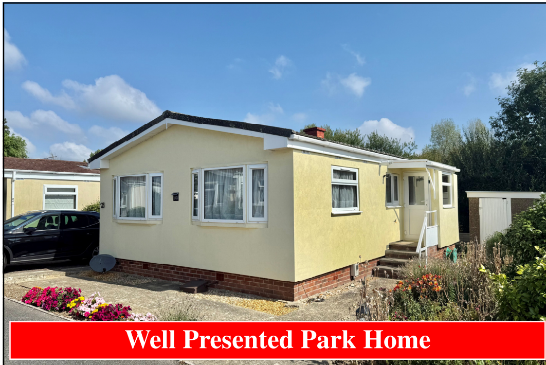
Well Presented Park Home

23 Selwood Park, Weymans Avenue, Kinson, Bournemouth. BH10 7JU