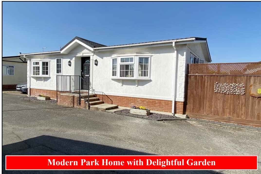
Modern Park Home with Delightful Garden

80 Pinehurst Park, West Moors, Ferndown, Dorset, BH22 0BP