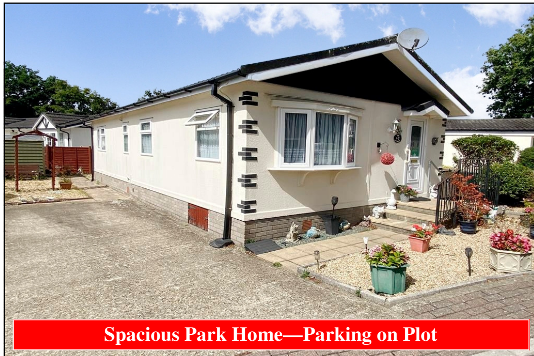
Spacious Park Home—Parking on Plot

5 The Acorns, Oaktree Park, St Leonards, Ringwood. BH24 2RH