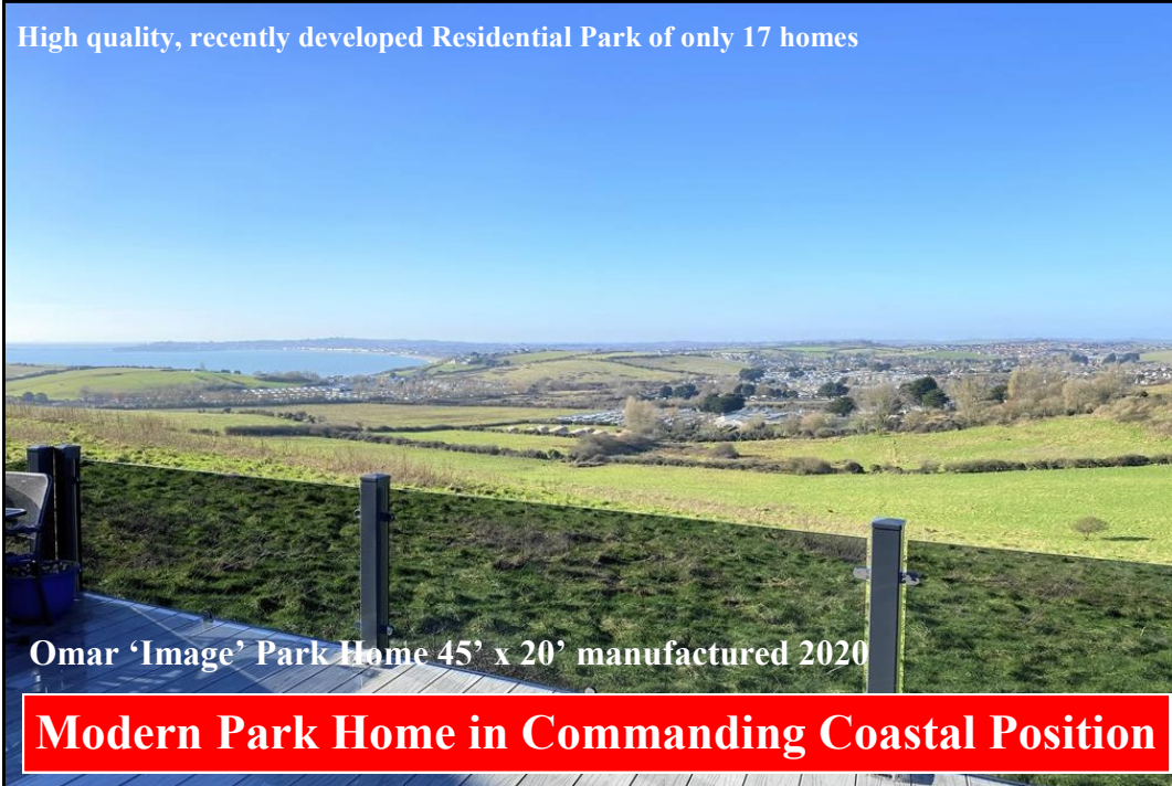
Omar 'Image' Park Home 45' x 20' manufactured 2020

High quality, recently developed Residential Park of only 17 homes