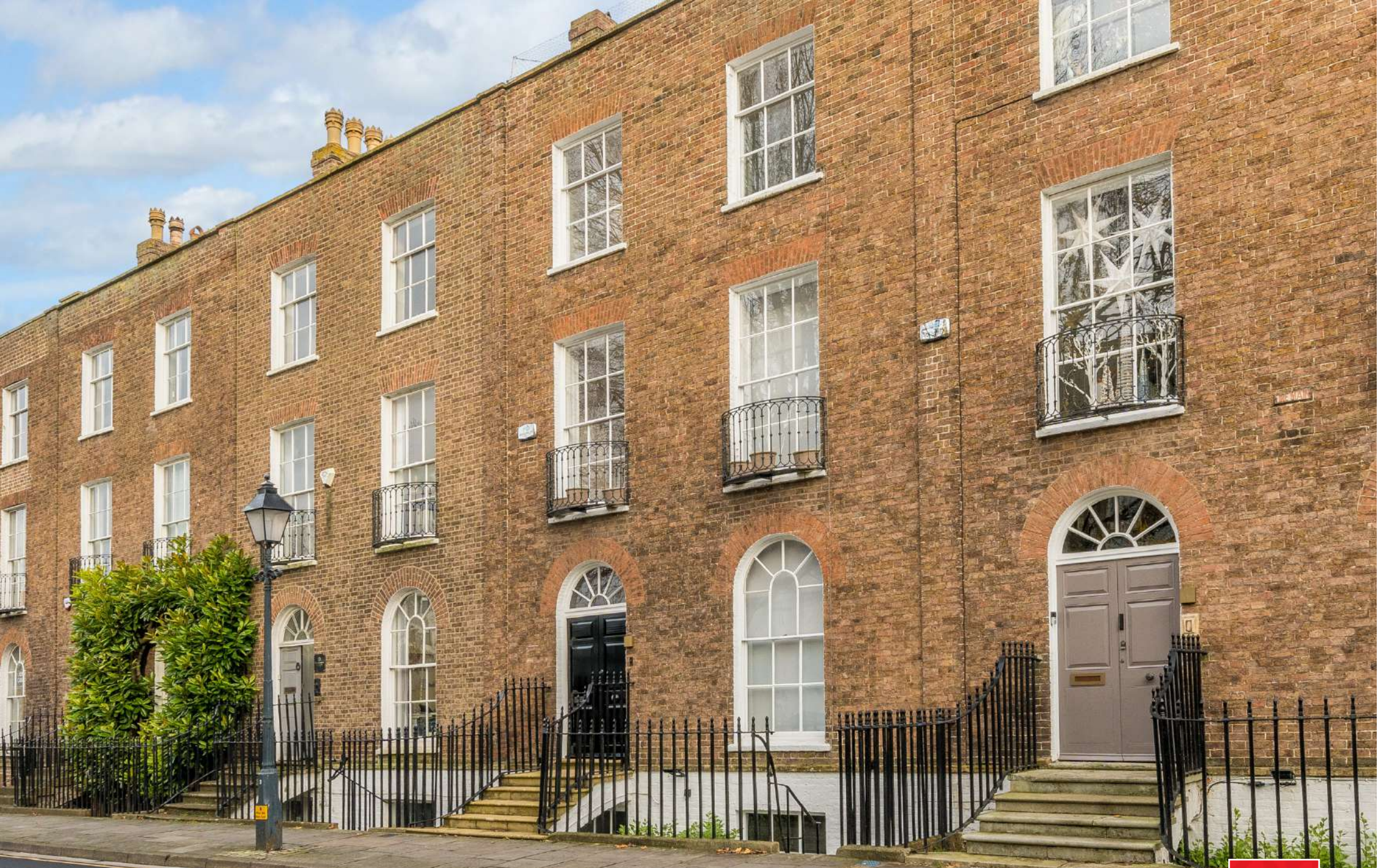
5 The Crescent Taunton TA1 4EA