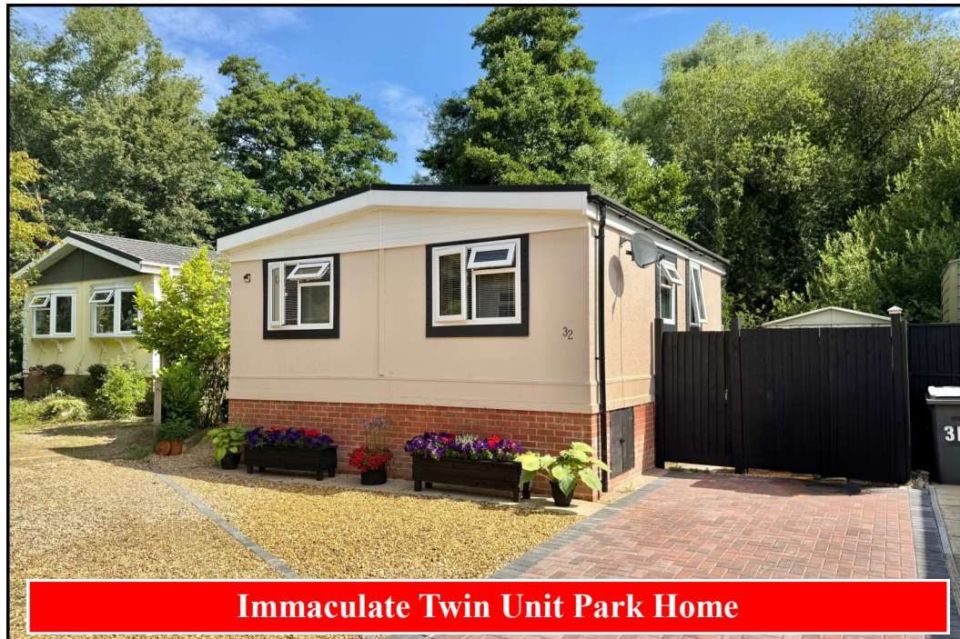
Immaculate Twin Unit Park Home

32 Redhill Park, Wimborne Road, Redhill, Bournemouth. BH10 7BW