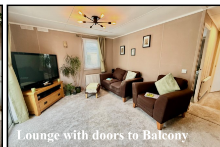
Lounge with doors to Balcony