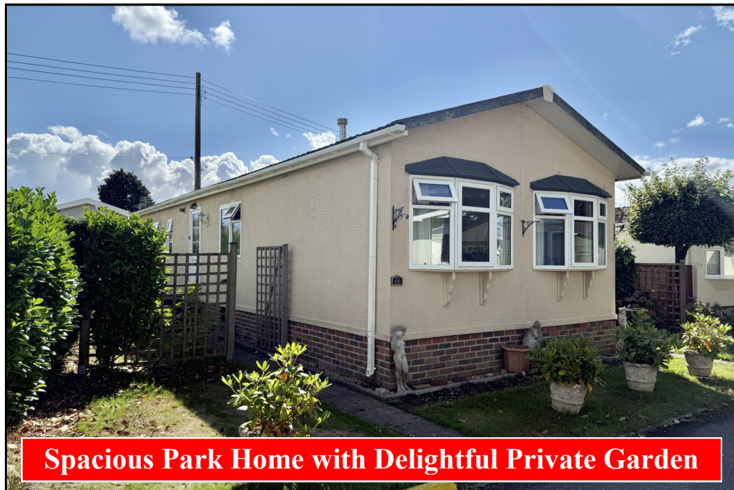
Spacious Park Home with Delightful Private Garden

66 St Leonards Farm Park, Ringwood Road, West Moors, Dorset. BH22 0AQ