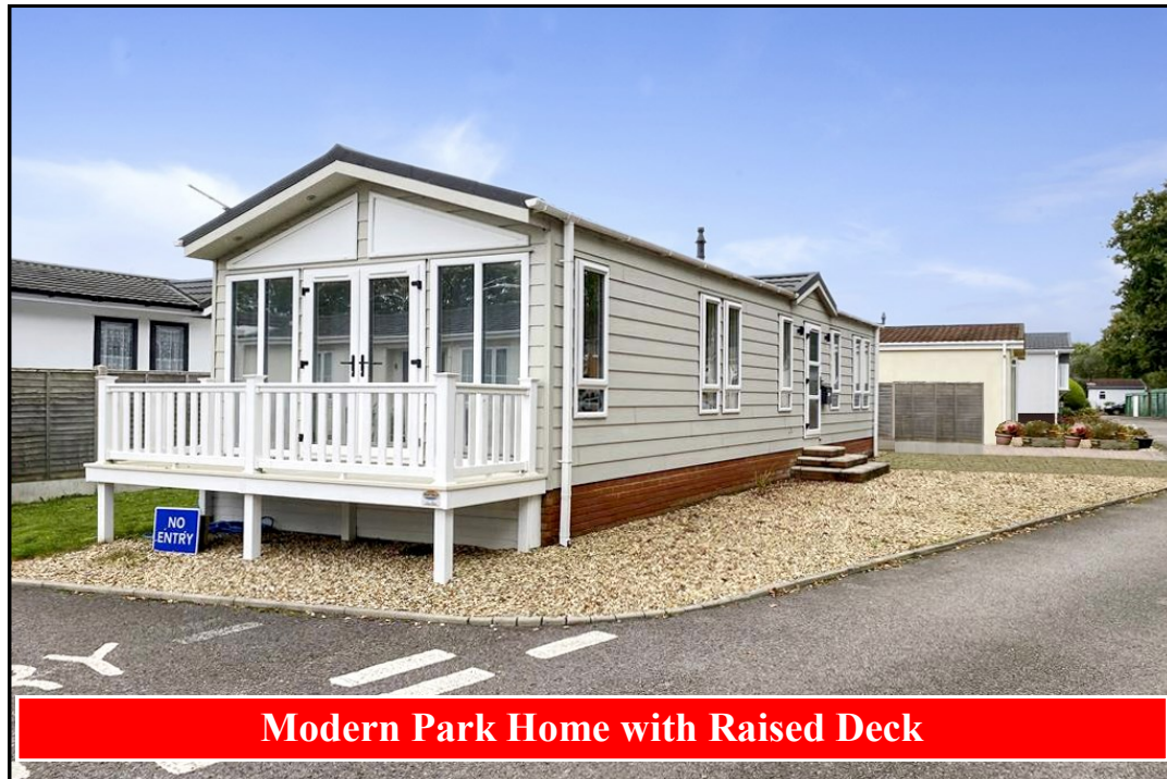
Modern Park Home with Raised Deck

44a Hillbury Park, Alderholt, Fordingbridge. SP6 3BW