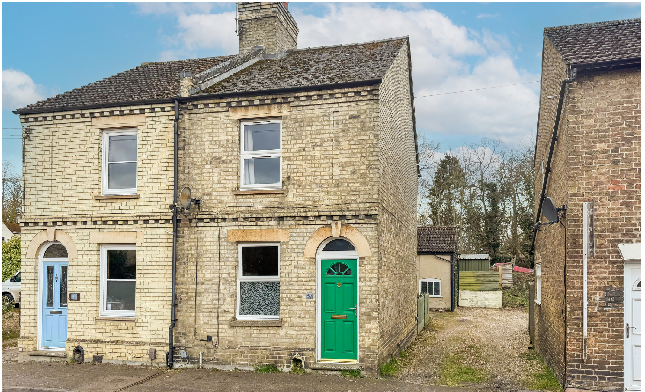
Chapel Street, Exning, Newmarket