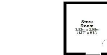
First Floor Approx. 35.5 sq. metres (419.2 sq. feet)