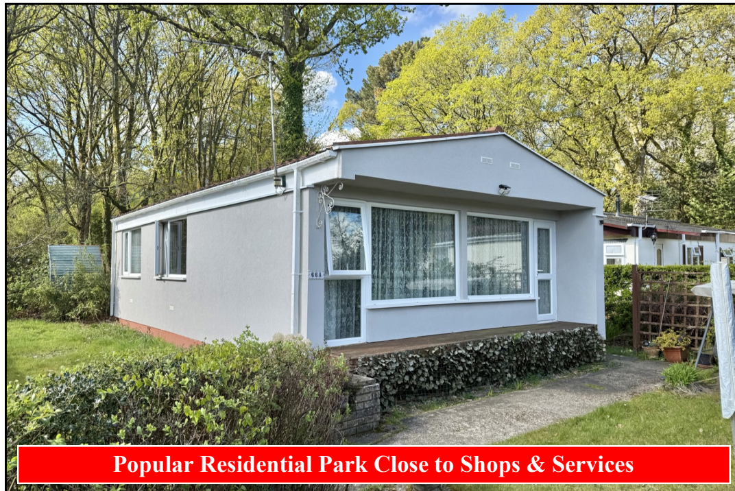
Popular Residential Park Close to Shops & Services

66a Gladelands Park, Ferndown, Dorset. BH22 9BW